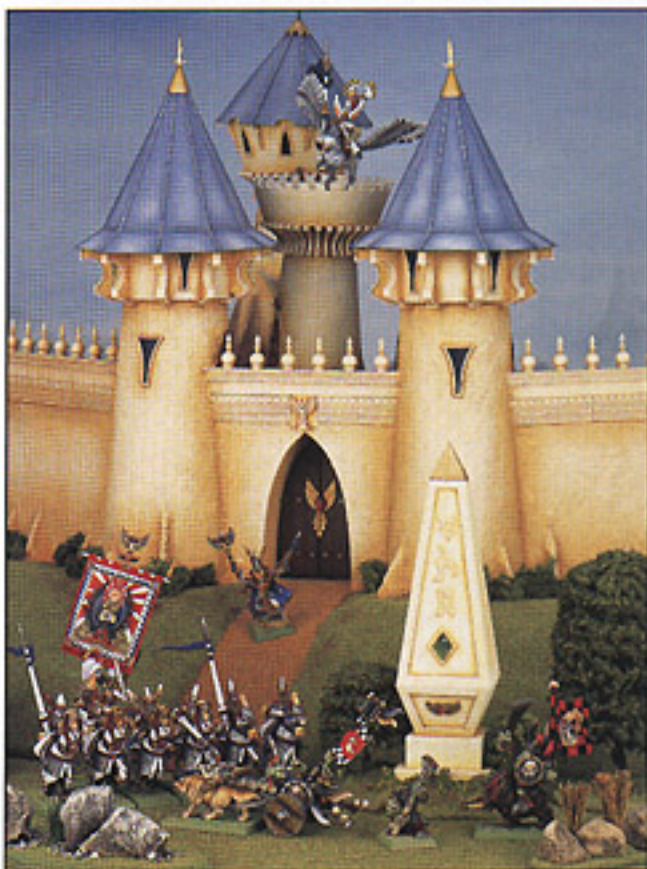
Silver Helms sally forth from a High Elf Fortress.

Until then, have a go yourself. There is plenty of scope for easy conversion work on the fortress. See what you can come up with and if you have any good ideas, send a photo of your fortress to White Dwarf . If it's really good we may even publish it!