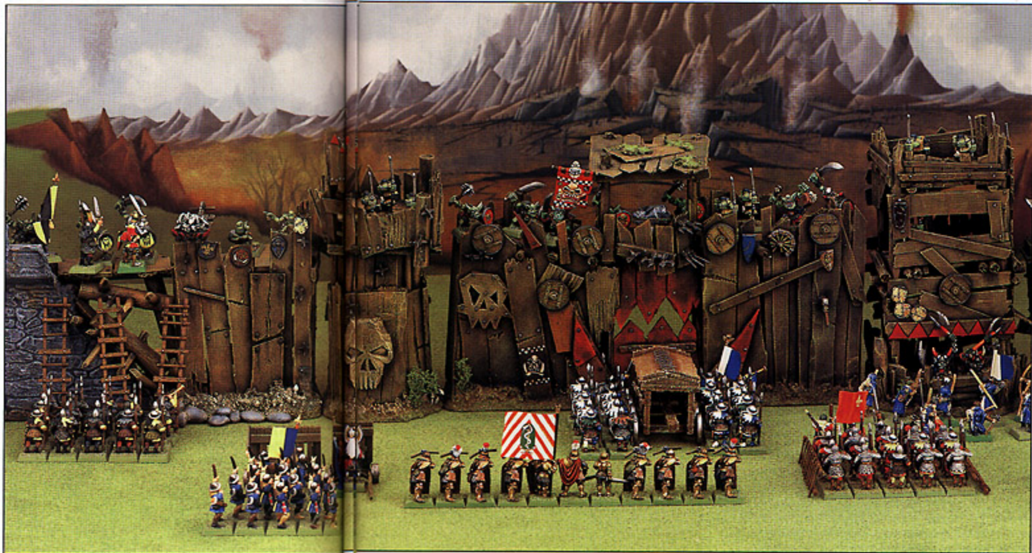
An Orc fortress is besieged by Bretonnians

With the release of the awesome Warhammer Fortress plastic kit, building a fortress for Empire or Bretonnian armies is now an easy thing to do! Just assemble the Fortress in the box and you have a castle perfect for a human lord. "But what about the rest of the Warhammer races?" I hear you cry. Never fear. With a little customization, the Warhammer Fortress can work for other races just as